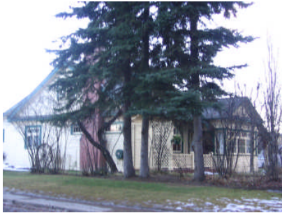
North and Front Elevation