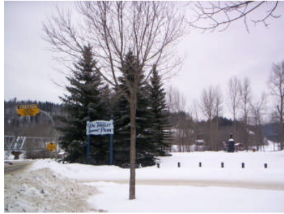
Ceal Tingley Memorial Park